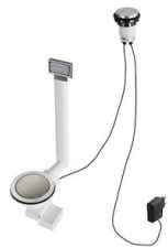
Space Light automatic waste fitting - PL 8407 117