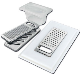
Graters kit with ring-holder and food collection tray 8159 101 * only in combination with the accessory 8644 101